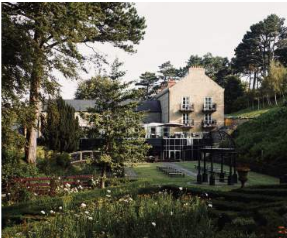
Raithwaite Sandsend, where a hotel forest garden has been created within its grounds.