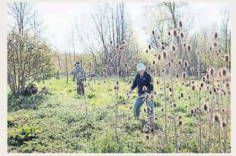
Regeneration: Workers at Deepdale Farm get stuck in